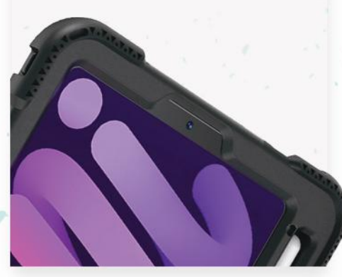
KICKSTAND + STRAP